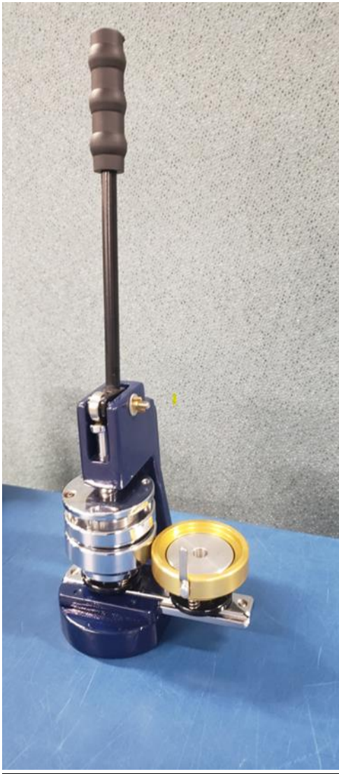
1. Button Press